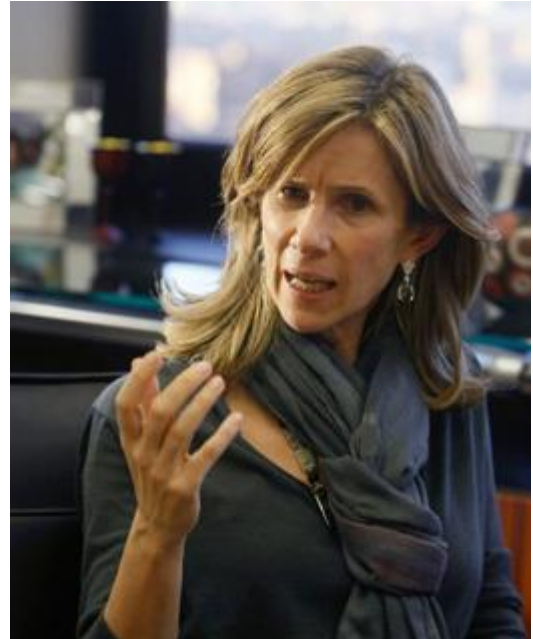
Science minister Cristina Garmendia maintains that the 2011 draft budget protects research.

The science and innovation ministry's draft budget includes a 1.65% cut in